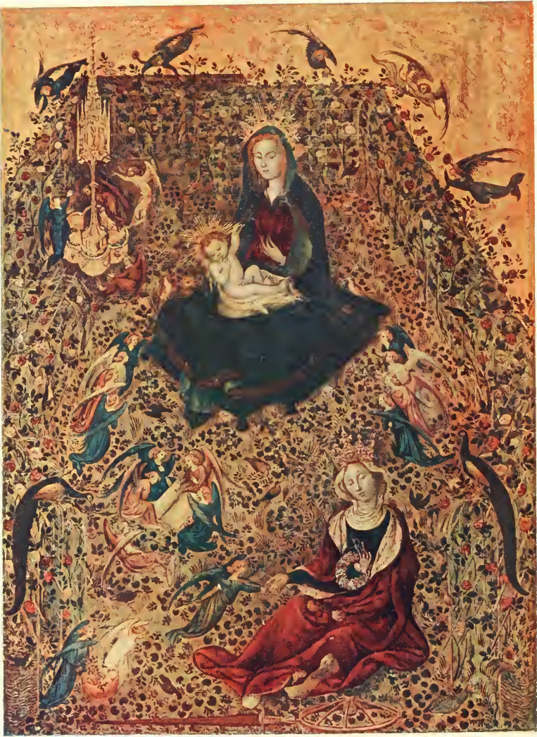
AN ITALIAN FANTASY BY STEFANO DA ZEVIO (VERONA).